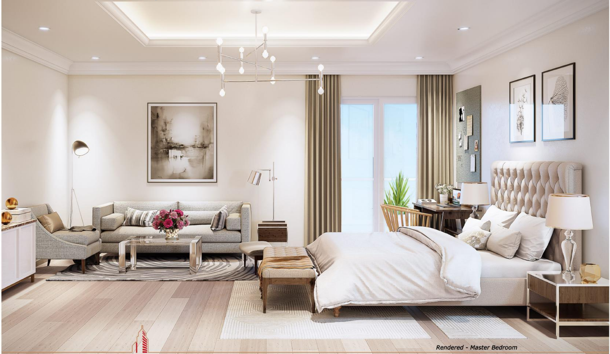
Rendered - Master Bedroom