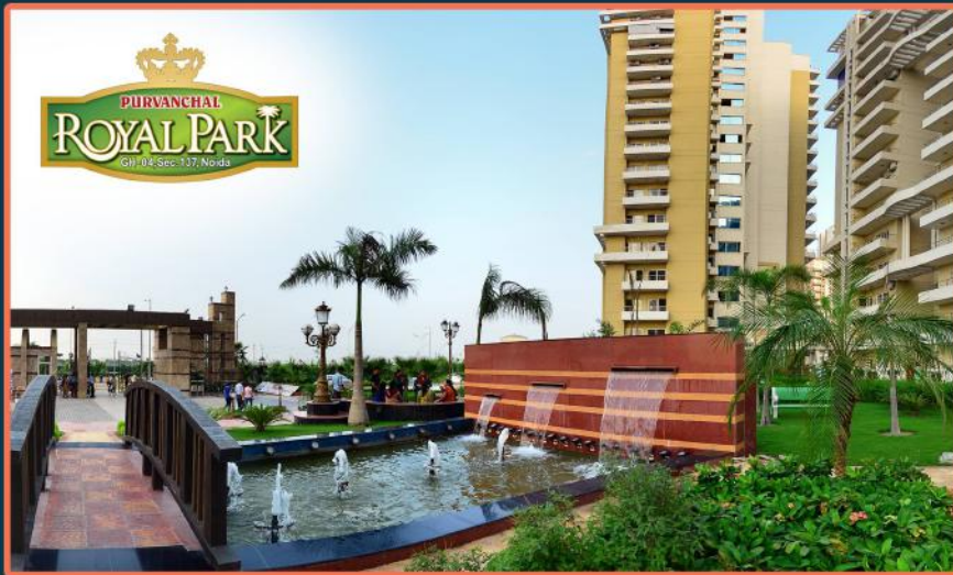
Purvanchal Royal Park (Sec-137, Noida)