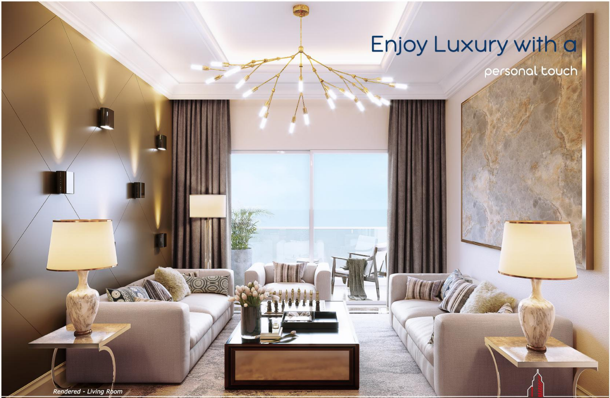
Rendered - Living Room