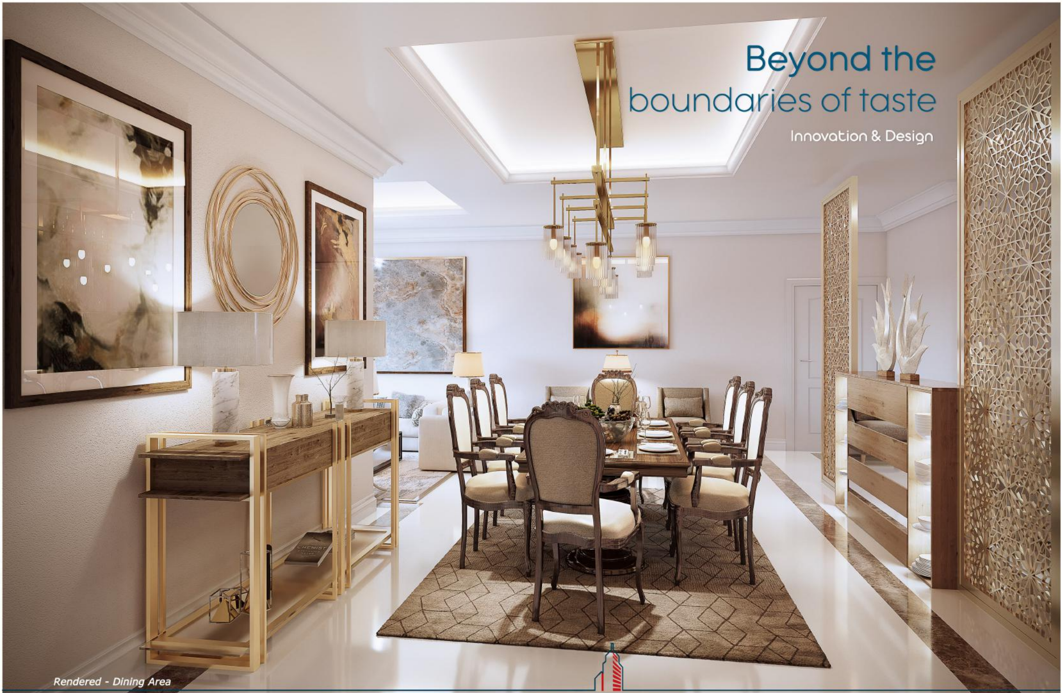
Rendered - Dining Area