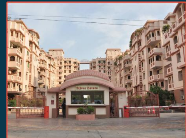
Purvanchal Silver Estate (Sec-50, Noida)

Disclaimer:- This contains Artistic Impression and no warranty is expressly or impliedly given that the completed development will comply in any degree with such artist's impression as depicted. This is not an offer, an invitation to offer and/or commitment of any nature. The furniture, accessories, paintings, items, electronic goods, additional fittings/fixtures, decorative items, false ceiling including shades, sizing and color of the tiles etc. in the image are only indicative in nature and do not form part of the standard specifications/amenities/services to be provided in the unit. All specifications and terms shall be as per the final agreement between the parties. The distances/estimated time of drive mentioned in the brochure is indicative/tentative. T&C apply.