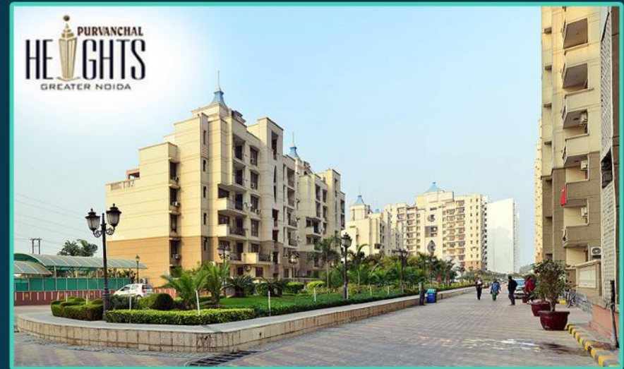
Purvanchal Heights (Gr. Noida)