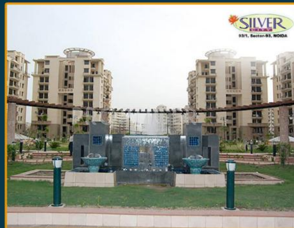
Purvanchal Silver City (Sec-93, Noida)