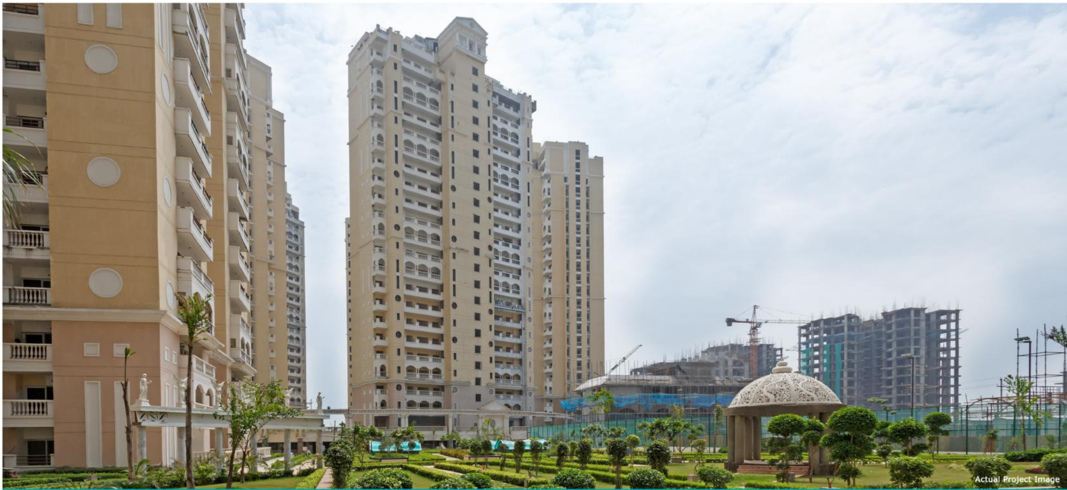
Actual Project Image