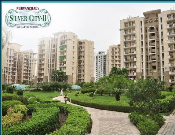
Purvanchal Silver City II (Gr. Noida)